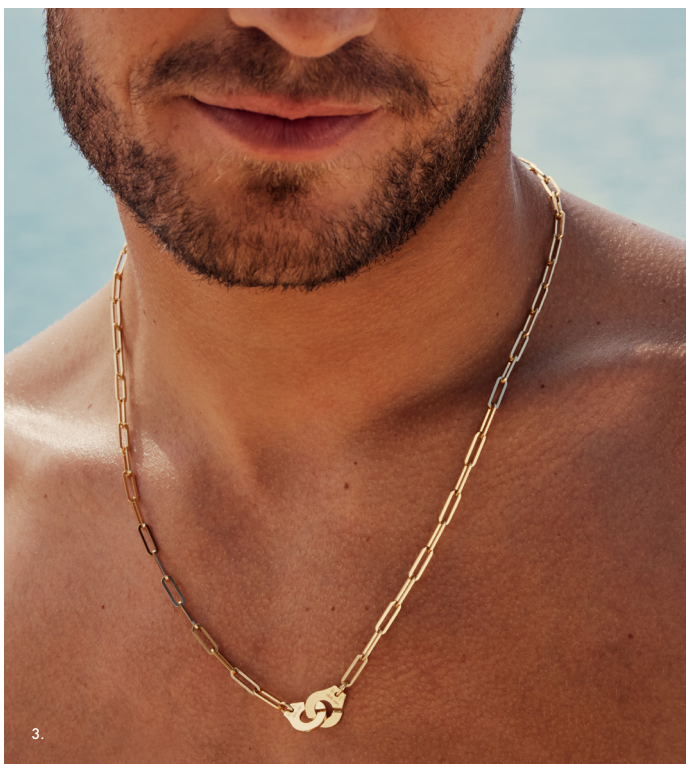
1. Menottes dinh van R 10 Bleu des Mers woven bracelet in white gold (1 000 \in ) • 2. Menottes dinh van R12 bracelet in platinum (3 100€) • 3. Menottes dinh van R12 necklace in yellow gold (6 350€) • 4. Serrure bracelet in yellow gold and diamond (3 600€) • 5. Serrure bracelet in white gold and diamond (3750€) • 6. Seventies ring (small model) in white gold (1 390€) • 7. Seventies ring (medium model) in white gold (2 290€).