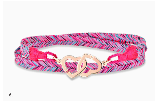
4. Double Cœurs R9 pendant, pink gold (1450€) • 5. Double Cœurs R15 pendant, pink gold and diamonds (€3,350) • 6. Double Cœurs Rose Paradis R13 woven bracelet, rose gold (950€) • 7. Menottes dinh van R7.5 earrings, yellow gold (790€) • 8. Menottes dinh van R7 chain ring, yellow gold (650€).