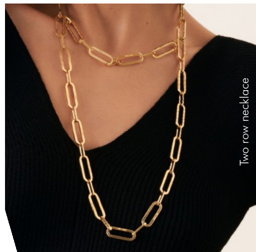
Two row necklace