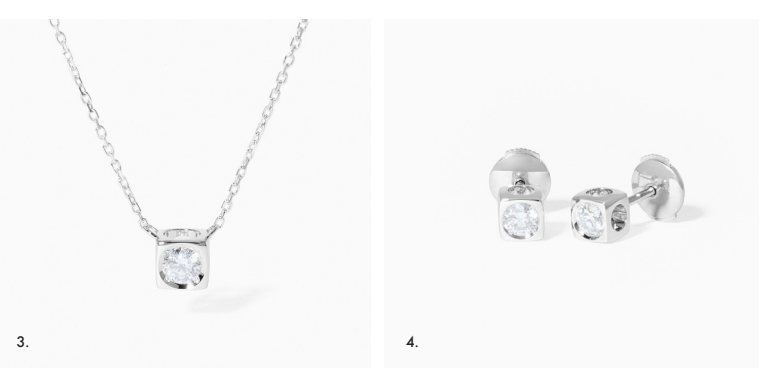
Le Cube Diamant medium necklace, white gold and diamond – 2070€ Le Cube Diamant large earrings, white gold and diamonds – 4820€.