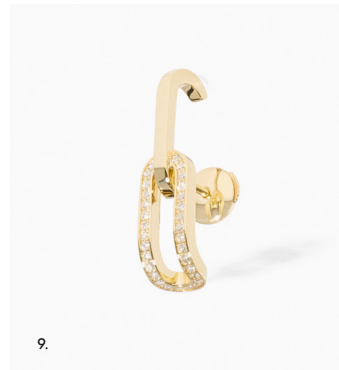
9. Maillon small mono earring, yellow gold and diamonds – €1,700 • 10. Maillon mono earring, yellow gold and diamonds – €5,900.

Two mono earrings in yellow gold with a curved, diamond paved link, inverted in mini and maxi versions, offer a bold asymmetrical style that naturally adorns the ear.