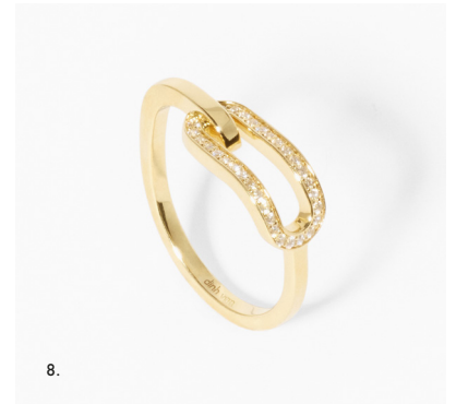
6. Maillon large ring, yellow gold – €2,900 • 7. Maillon small ring, white gold and diamonds – €1,950 • 8. Maillon small ring, yellow gold and diamonds – €1,850.

Two mono earrings in yellow gold with a curved, diamond paved link, inverted in mini and maxi versions, offer a bold asymmetrical style that naturally adorns the ear.