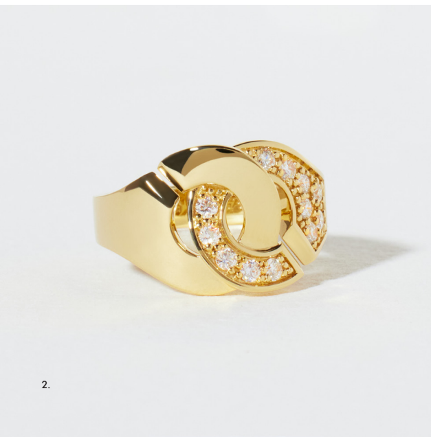
1. Menottes dinh van R16 ring, yellow gold – 3 990€ • 2. Menottes dinh van R12 ring, yellow gold and diamonds – 4 250€ • 3. Menottes dinh van R13,5 necklace, yellow gold and diamonds – 11 450€ • 4. Menottes dinh van R13,5 necklace, white gold and diamonds – 12 140€ 5. Menottes dinh van R12 bracelet - 21 cm, platinum – 3 820€ • 6. Menottes dinh van R12 bracelet - 21 cm, yellow gold – 3 530€

This design effuses bold elegance with a resolutely modern touch.