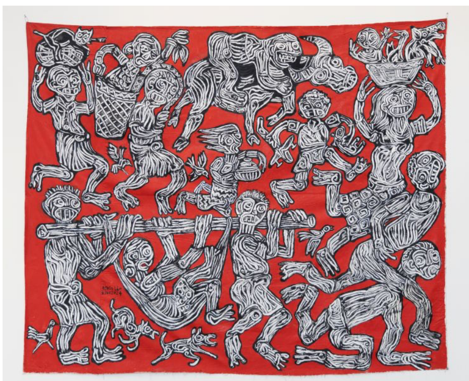
HTEIN LIN, Echoes of Strife 1 , 2024 Acrylic on cotton, 264,16x213,36

A special performance for Asia Now by Hiromi Tango (Japan), contemporary artist working predominantly with textiles in installation and performance art.