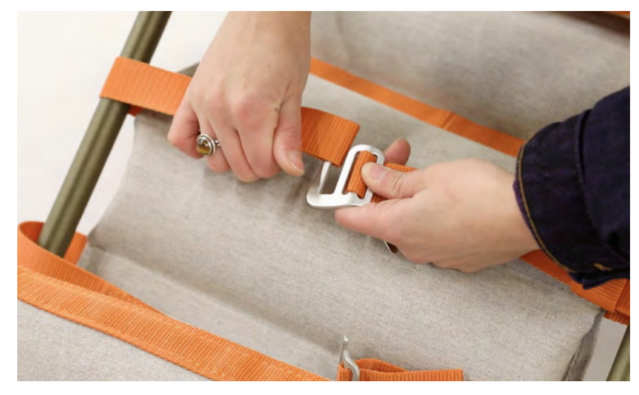
Maak & Transmettre À l'ombre, alanguies, 2022