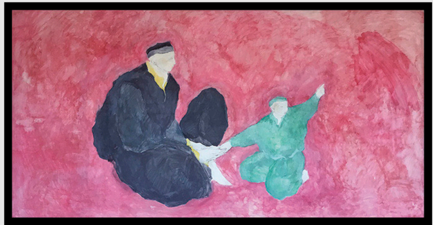
Samantha McEwen And the Child Knew 1985 gouache and acrylic on paper pasted on canvas 122 x 234 cm