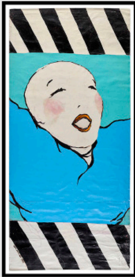
Samantha McEwen Untitled 1983 house paint on canvas 315 x 145 cm