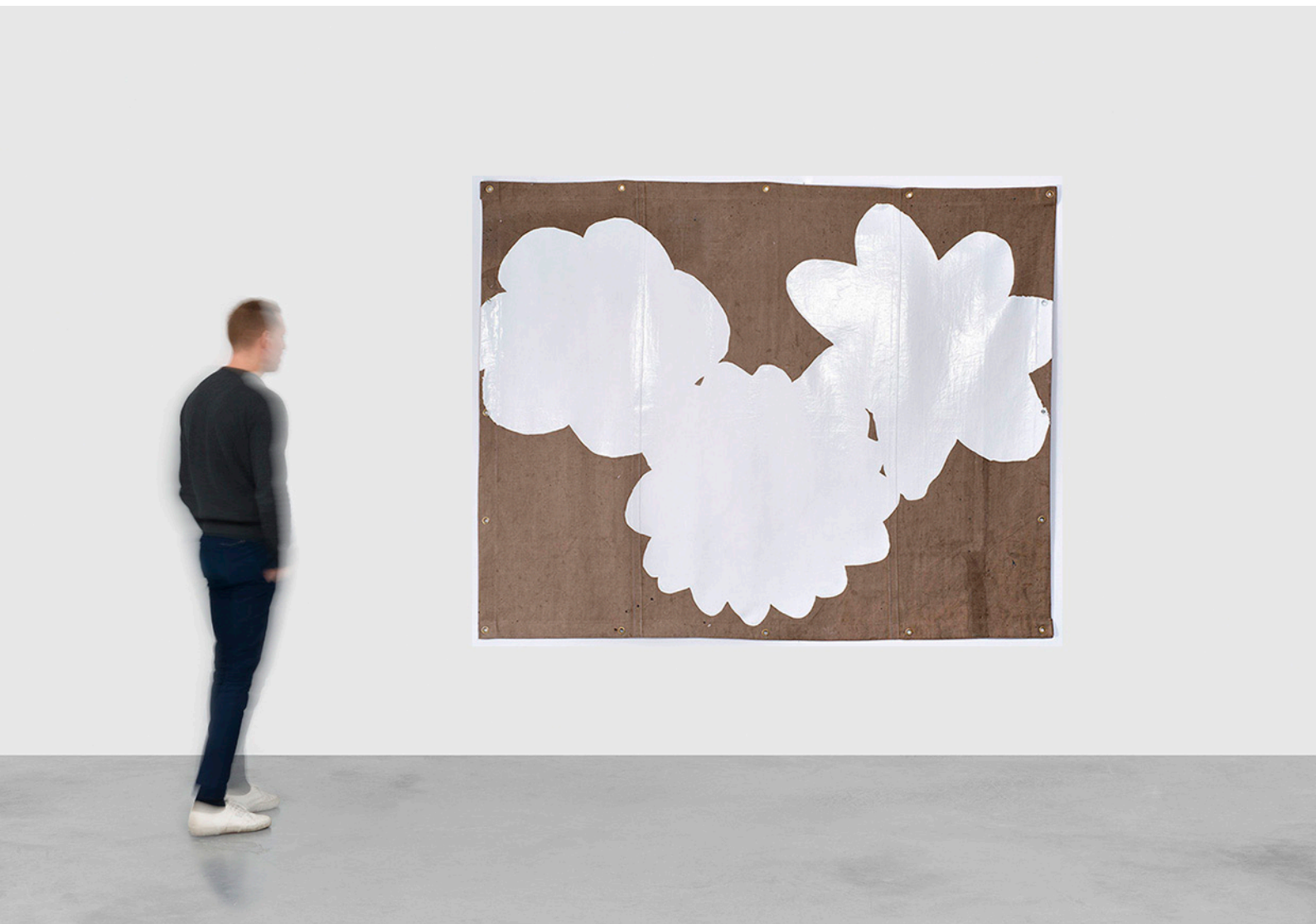
Samantha McEwen Posy Painting 2021 acrylic on tarpaulin 172 x 222 cm