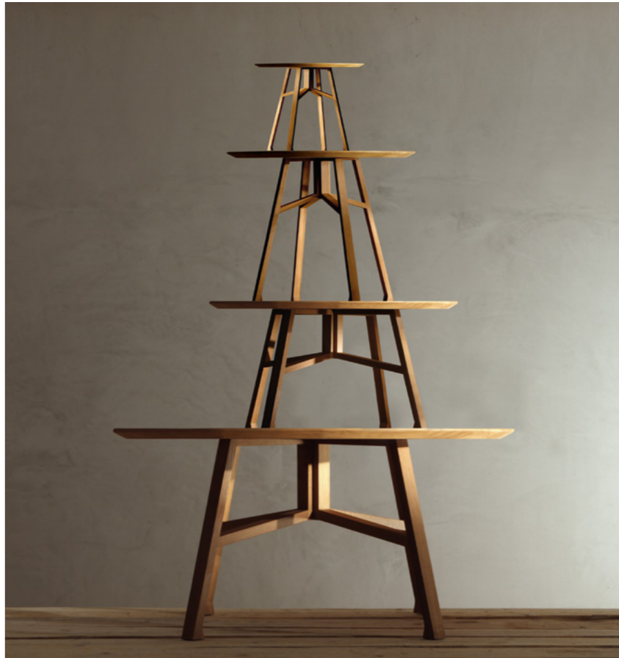
Limone, Raw metal, 2005. Serie Il giardino.