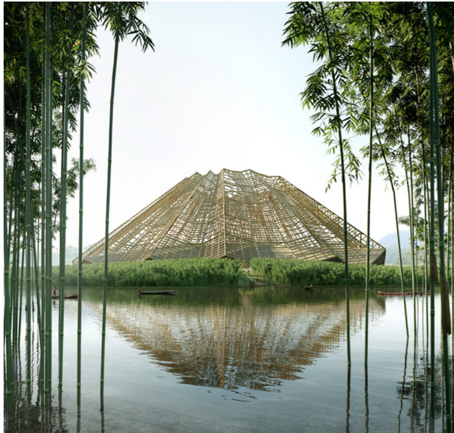
La Pista. Arese, 2015.