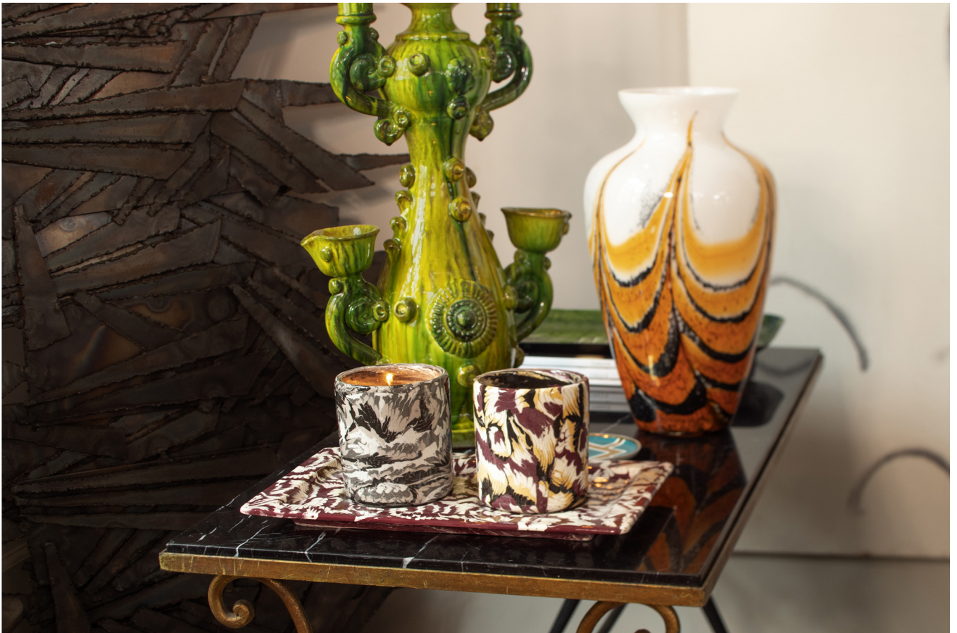
Sicilian handmade candle stick. Tray and candle holders by Gilles Dewavrin.