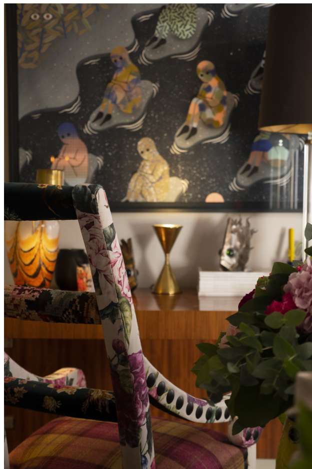
Scandinavian desk, 1st dibs Italian Lamp found at Parma Fair