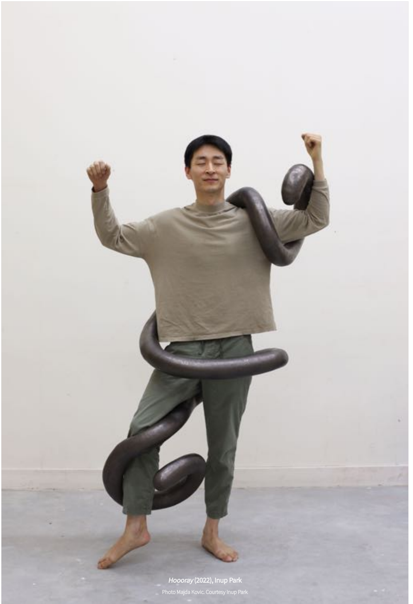
Hooray (2022), Inup Park