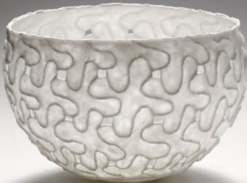
Big Mind Circles (2020), Guy van Leemput