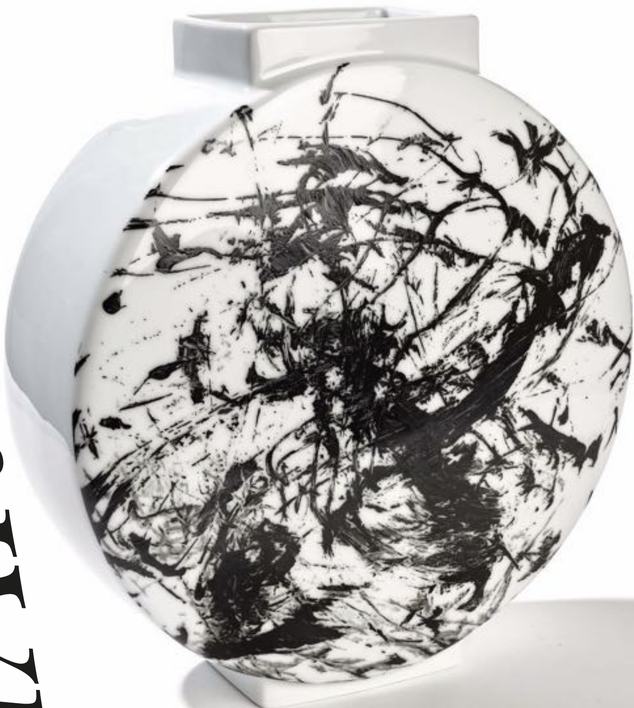
Dragon noir (2008), Zao Wou-Ki