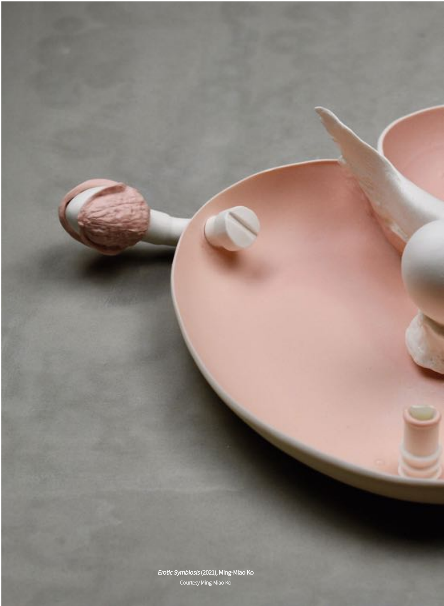
Erotic Symbiosis (2021), Ming-Miao Ko