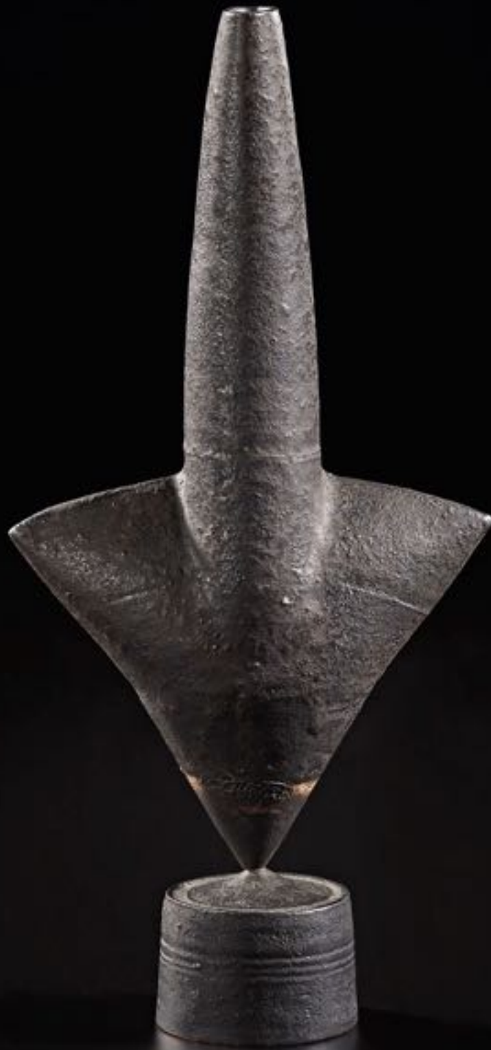
Cycladic arrow form (1970), Hans Coper