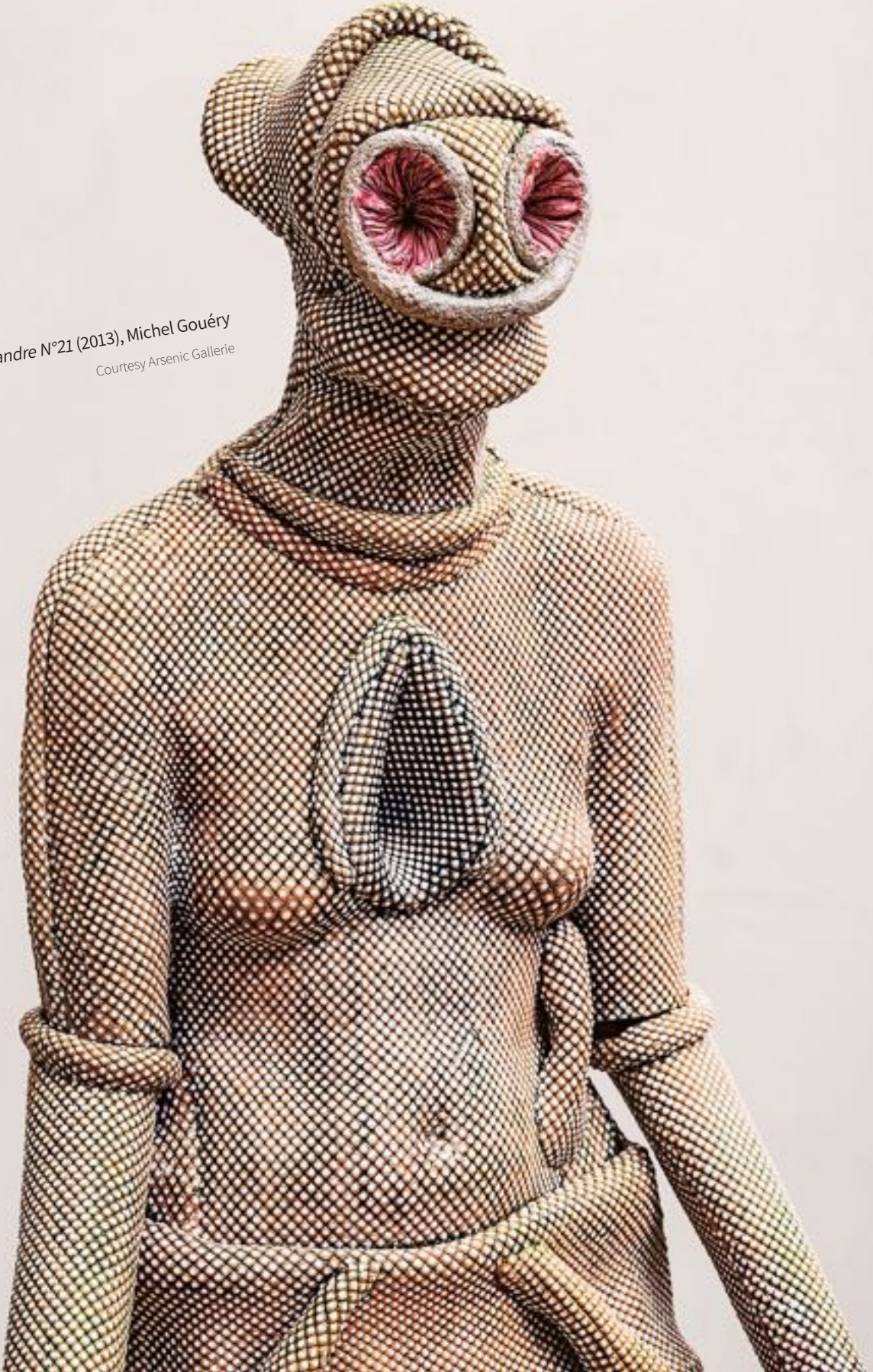
Anti-scapandre N°21 (2013), Michel Gouéry