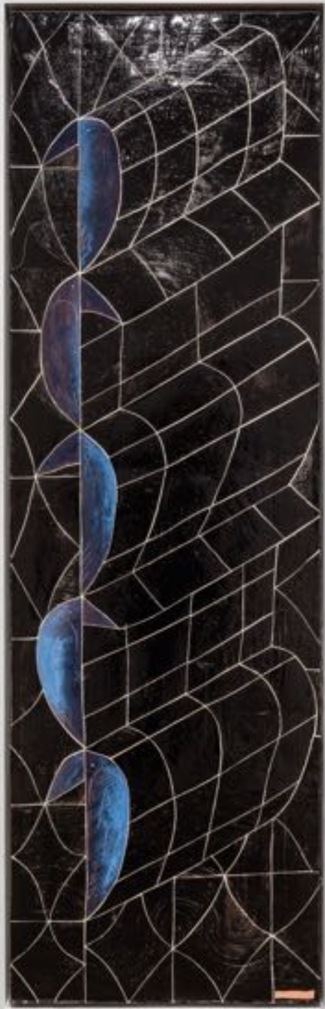
Les oiseaux bleus (2022), Maximilien Pellet