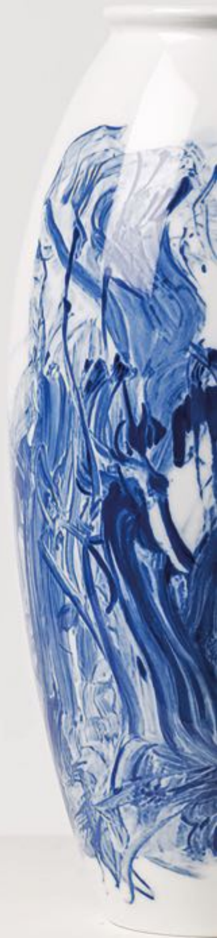
Hommage à Li-Po (2008), Zao Wou-Ki