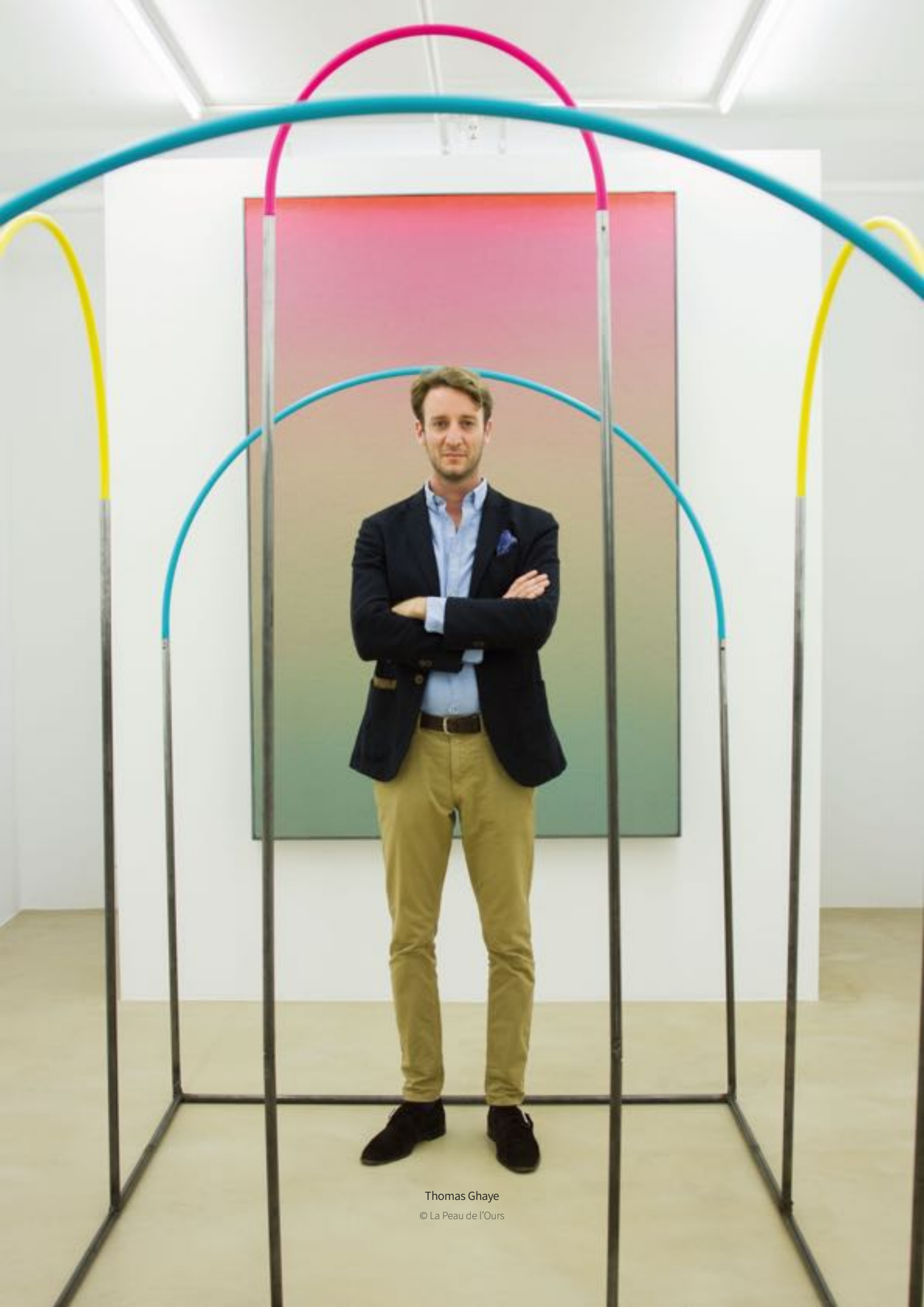
Thomas Ghaye © La Peau de l'Ours