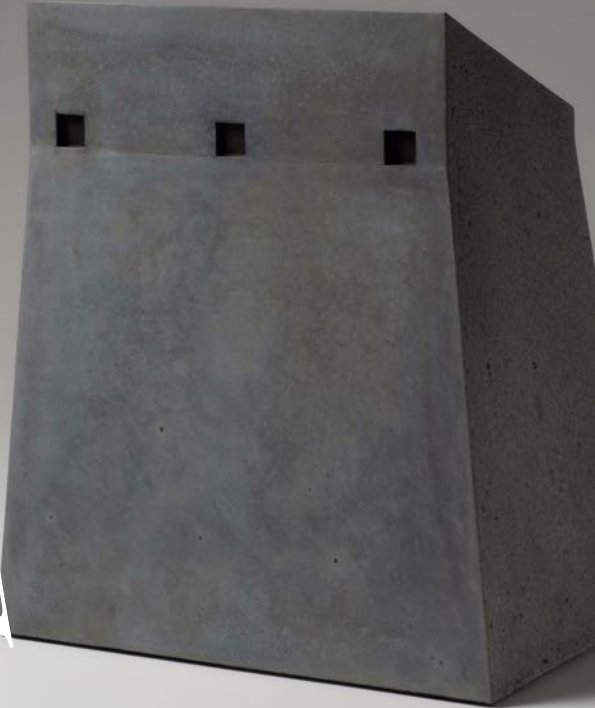
Untitled (c.1990), Enric Mestre