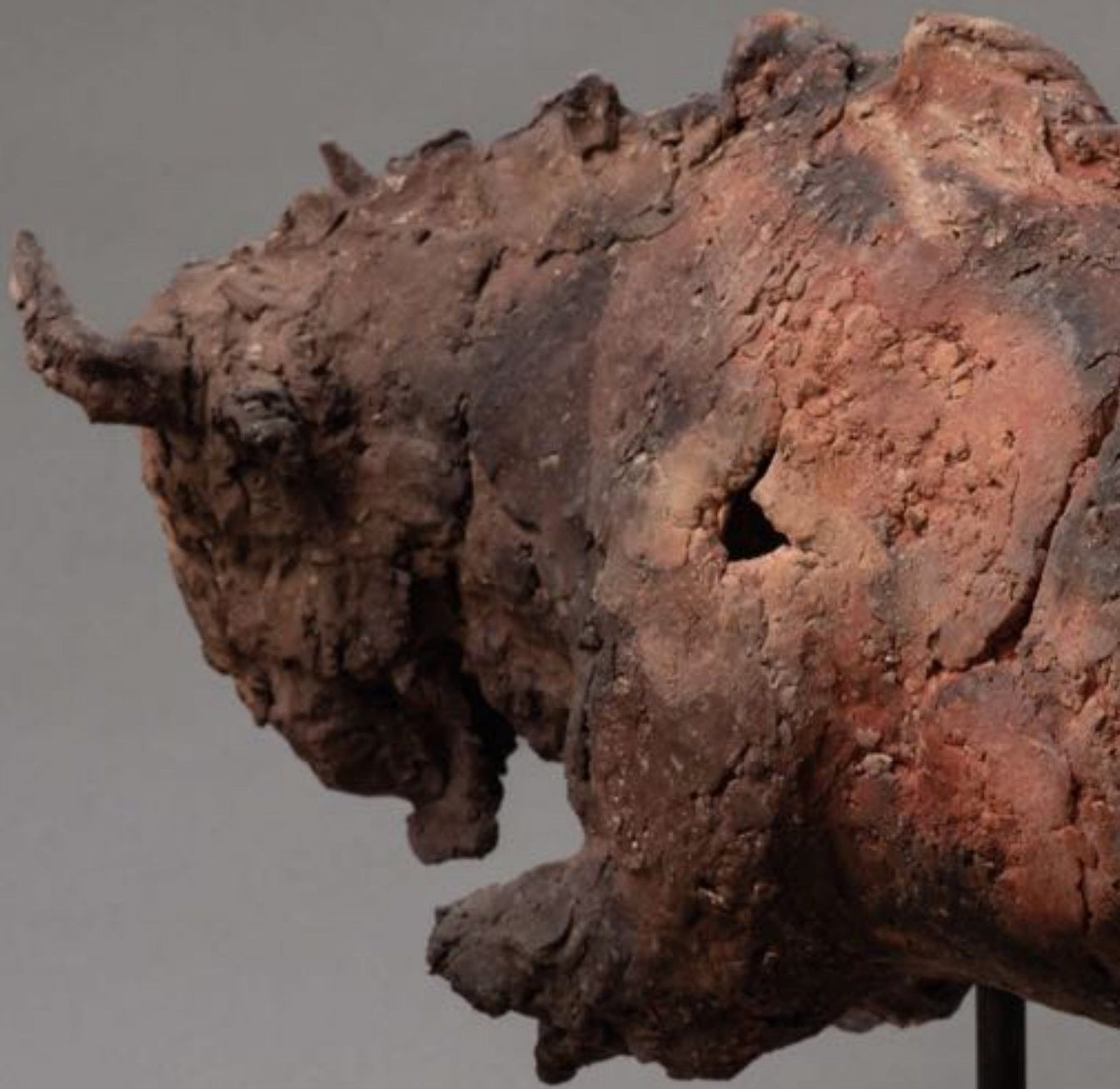
Gnou (2013), Ule Ewelt