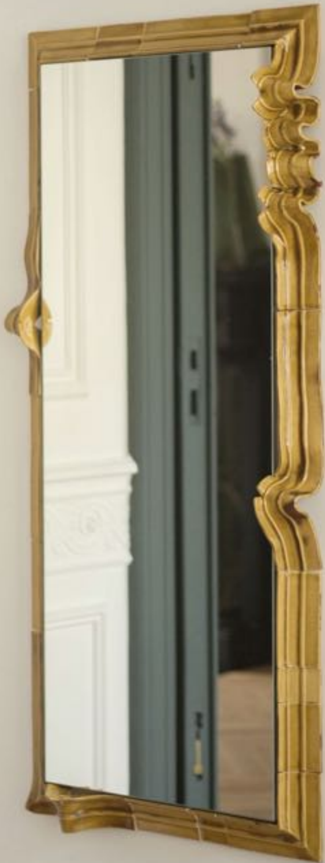
Ayna Mirror (2022), Studio Biskt