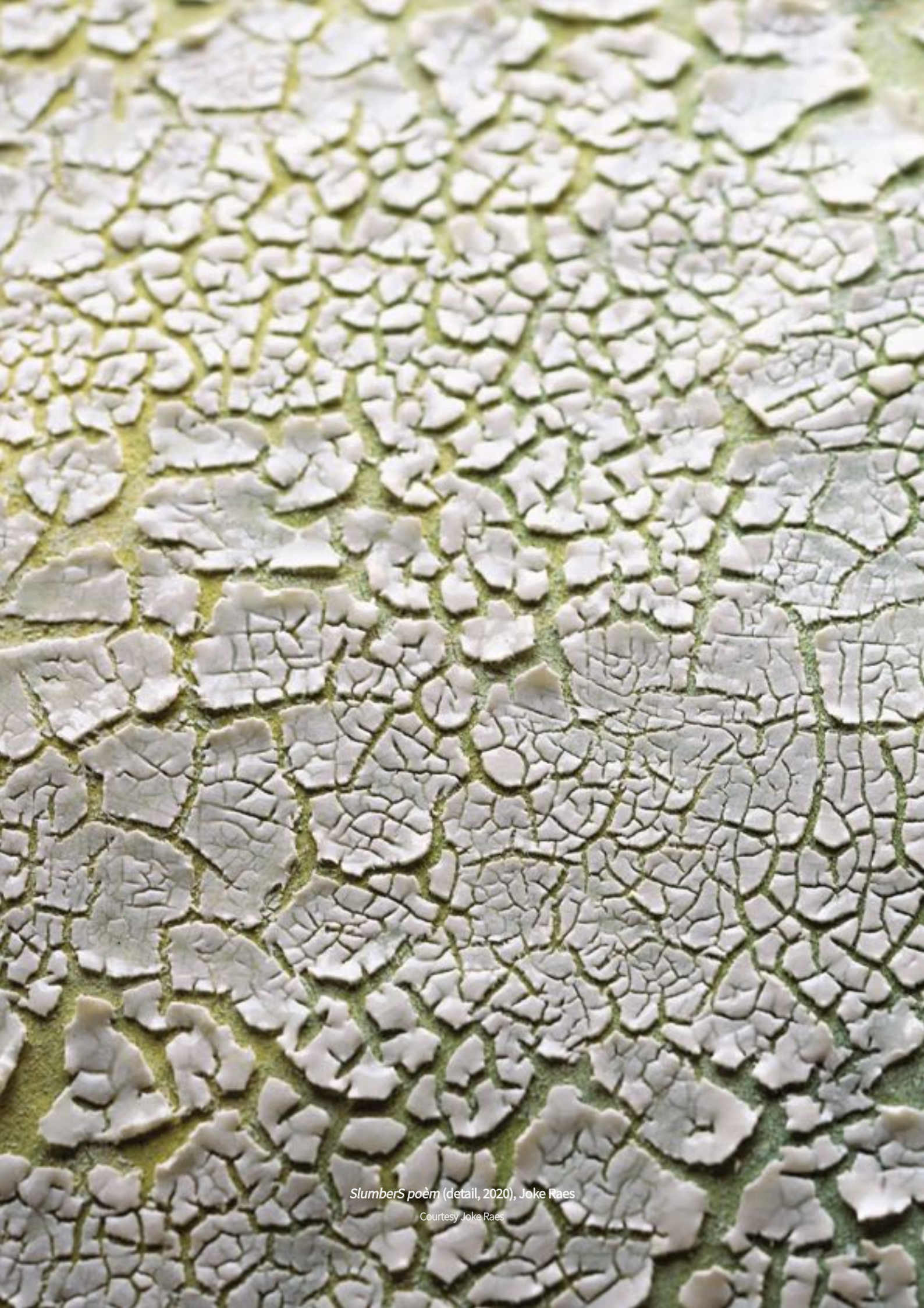
SlumberS poëm (detail, 2020), Joke Raes